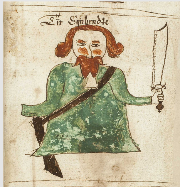
A drawing of Týr , after losing his hand.

If your conscience will not allow you keep to follow these taboos within the confines of the Vé, please do not enter the enclosure. It is permissible to view what takes place inside of the Vé from outside of the Vé-bond rope, so long as you do not interact with anyone or anything in the sacred space in word or deed.