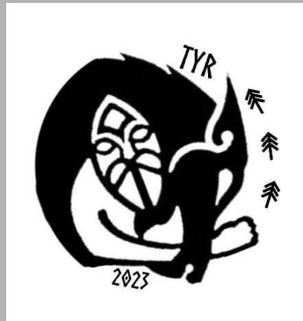
Drawing of Týr and the Fenris Wolf.

The Witan of Hail and Horn Gathering endorse the Canadian Pagan Declaration on Intolerance and Declaration 127.