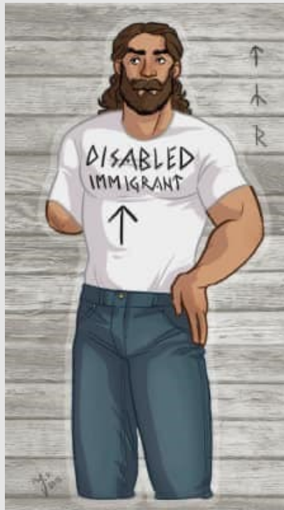
Cartoon drawing of Týr wearing shirt with Týr rune and the words “Disabled Immigrant”